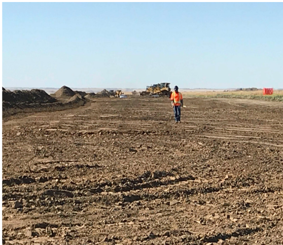
13. Stripping Crew located at 111km and 400 – Sept 28, 2017