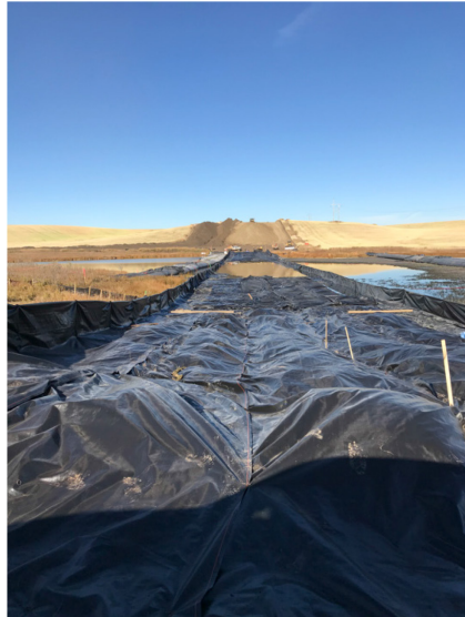
12. Water dam draining and prep for crossing located at 68km and 300 – Sept 28, 2017