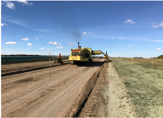
11. Ditcher located at km9+600 – Sept 27, 2017