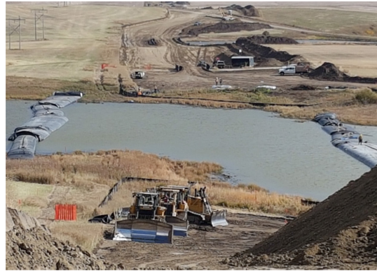
6. Waterway located at km68 and 200 – Sept 26, 2017