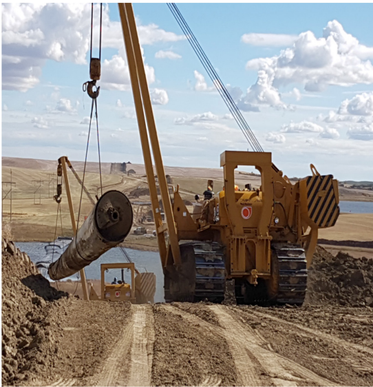
7. Boom located at km 68 and 200 – Sept 26, 2017