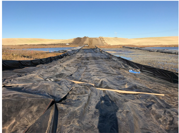
14. Water crossing construction, tarp laid out and proceeding to cover with dirt. Location 68km and 300 – Sept 29, 2017