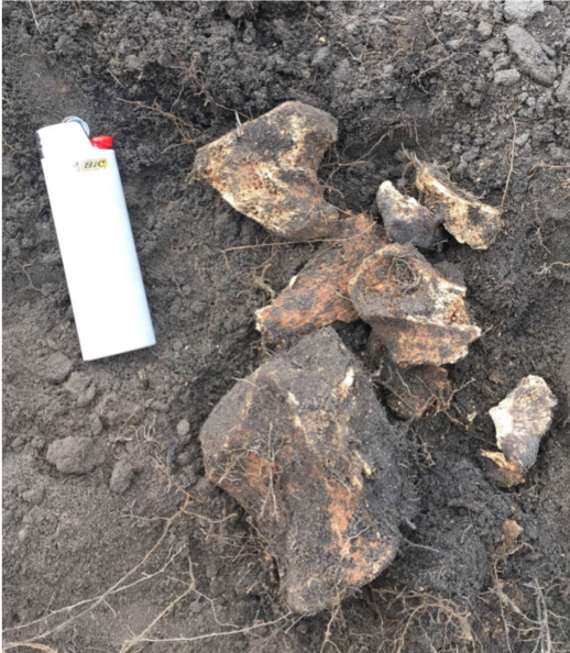
1. Bones found at km 69+400 - Sept 25, 2017