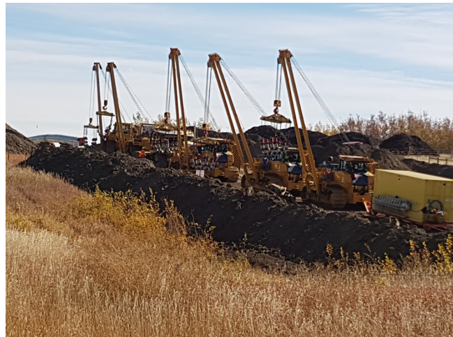
10. Booms located at km6+800 – Sept 27, 2017