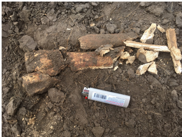
3. Bones found at km 69+400 – Sept 25, 2017