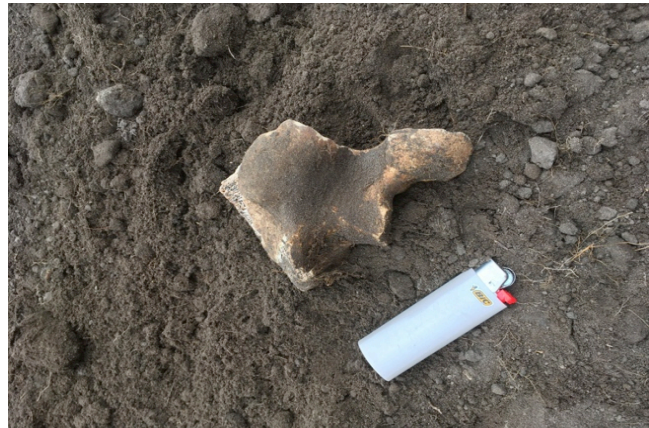
2. Bone found at km 69+400 – Sept 25, 2017