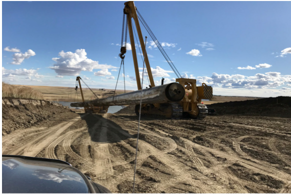
5. Boring crew move located at km68 – Sept 26, 2017