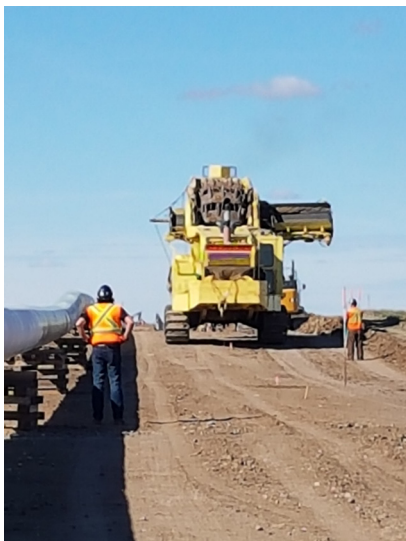
9. Ditcher located at km9+600 – Sept 27, 2017