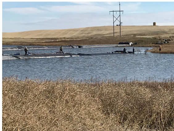
4. Water Dam at km 68 and 200 - Sept 26, 2017