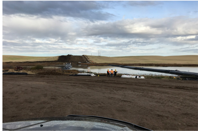
8. Aqua dam located at km68+400 – Sept 27, 2017